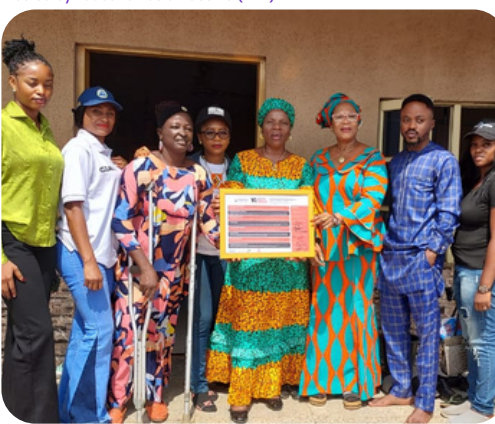
GEAI, TEC, DO, CWEENS FCT, NAPTIP, UAF, NWWD carrying out advocacy to recruit men as allies in their efforts to tackle GBV