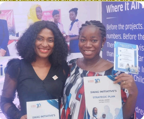
GEAI attends Stand With A Girl Initiative's 10-year anniversary celebration