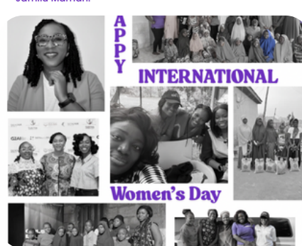
Images from International women's day celebration and sensitization held at HyeI Glory International school, Karomajigi