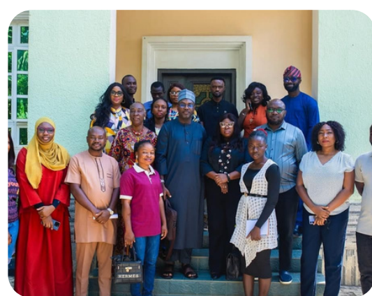
GEAI attends a policy review meeting hosted by Youth Hub Africa

The Girls Education Access Initiative is a non-profit organization dedicated to championing the rights of vulnerable Young Women and Girls to quality education. We firmly believe that education is a powerful tool for empowerment and can significantly contribute to gender equality, poverty eradication, and inclusive economic growth