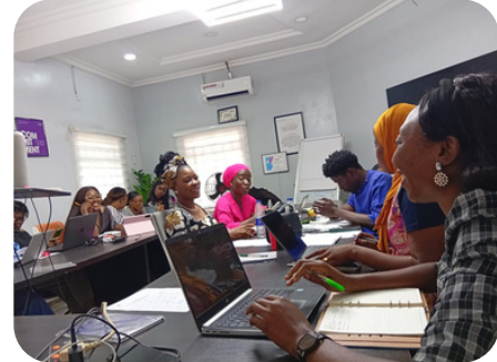
GEAI represented at the 2-day consultation meeting aimed at strengthening youth-led advocacy for adolescents well being in Nigeria, hosted by Education as a Vaccine (EVA)